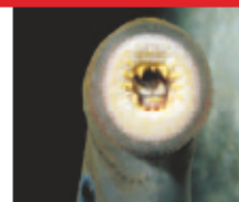
FISH PHEROMONES MADE IN THE LAB Lampreys could be lured away from Great Lakes by artificial chemicals. www.nature.com/news